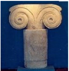
Aeolian capital at Lesvos