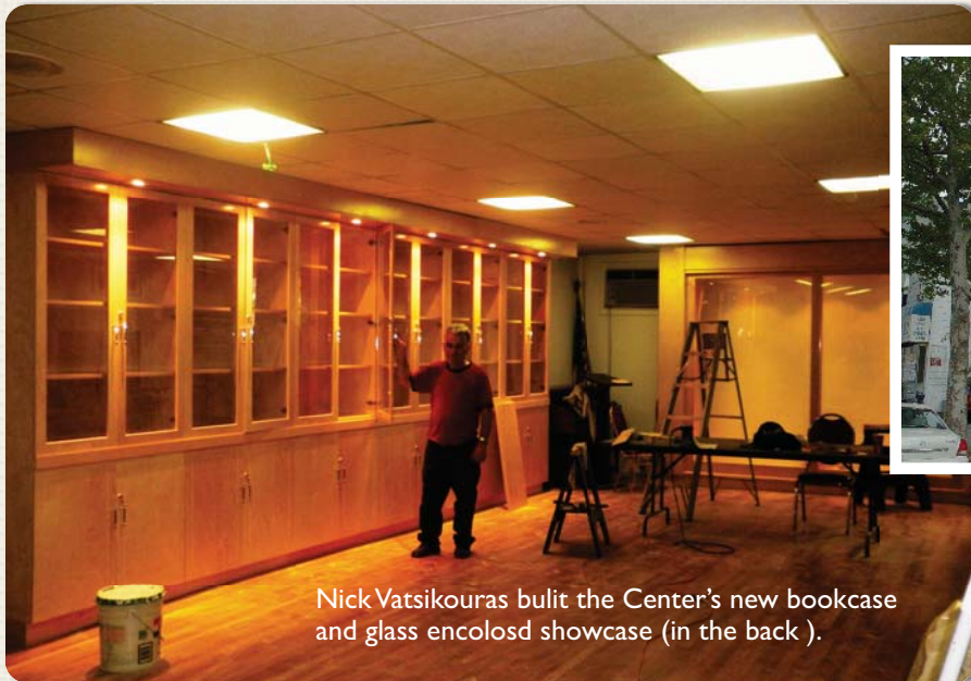
Nick Vatsikouras built the Center's new bookcase and glass enclosed showcase (in the back).