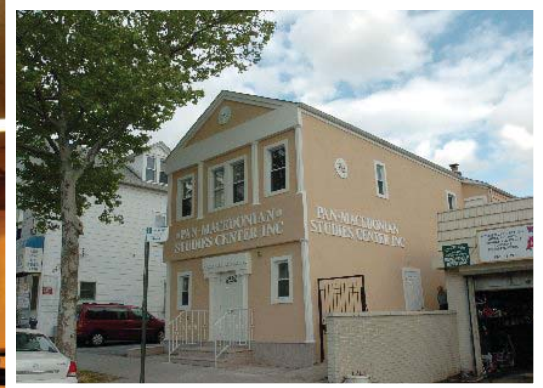
The Pan Macedonian Studies Center, better known as the hospitable "Macedonian House".